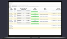
Egoo I Lab