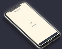
Egoo Connect App